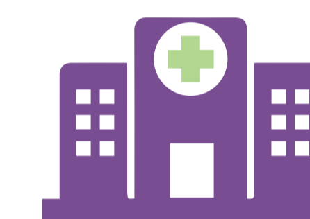
Access to healthcare