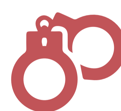
Crime and fear of crime