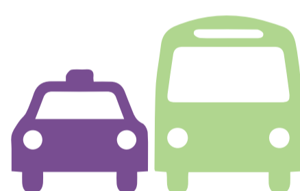
Access to public transport